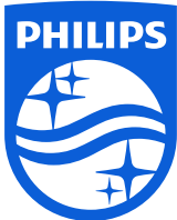
ESSENNG Erp 11W CDL E27 220-240V 50/60Hz